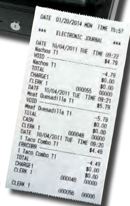
Electronic Journal Report sorting only voids shown 75% actual size.

The journal can be archived electronically for printing at end-of-day, or can be collected on an SD card. A variety of electronic journal options are available that allow you to quickly audit selected activities.